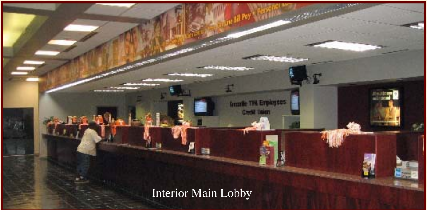
Interior Main Lobby