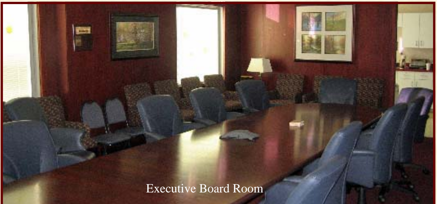
Executive Board Room